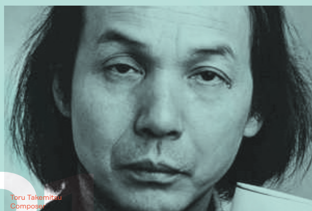
Toru Takemitsu Composer

Yoshihisa Taira (JPN/FRA) Maya for Bass Flute (1972) Thorkell Sigurbjörnsson (ISL) Kalais for Flute (1976) Diego Luzuriaga (ECA) Paris-Yangana-Paris for Flute (1984) and Tierra... tierra... for Flute/Piccolo and Flute/Alto Flute (1992)