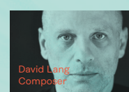
David Lang Composer