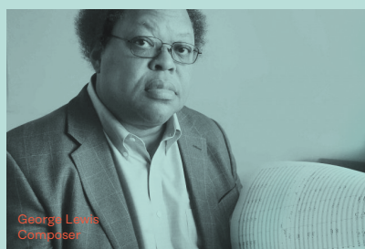
George Lewis Composer