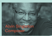
Alvin Singleton Composer